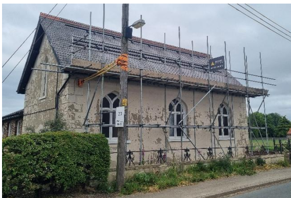
Work in progress on solar panels at Hessay.